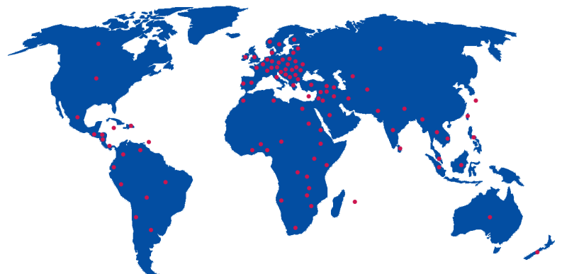
Nationalities of EIT Master and PhD students

Our societies face rapid and continuous change caused by technological advances. This brings both opportunities and challenges for Europe. Some jobs will disappear, whilst others will be created, and industries will be transformed. We need to ensure that skills and competencies in Europe are conducive to innovation and that future talent has the knowledge and skills to thrive and be at the forefront of innovation. That's precisely what the EIT is delivering.