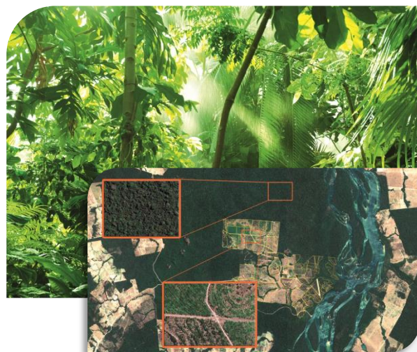
FOREST maps are based on earth observation satellite information

The consortium members were able to combine their strengths to create FOREST, and their complementary expertise and know-how has been essential to the project. Following on from the successful demonstration workshops carried out in 2015, FOREST is now at the commercialisation stage and building a go-to-market approach.