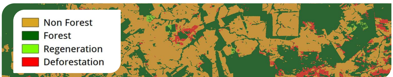
Baseline map classifying forest and non-forest areas